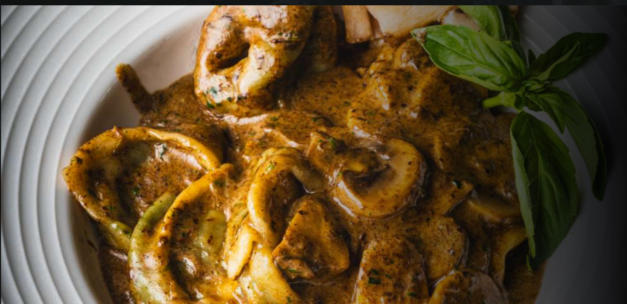
Cappelletti de Espinaca